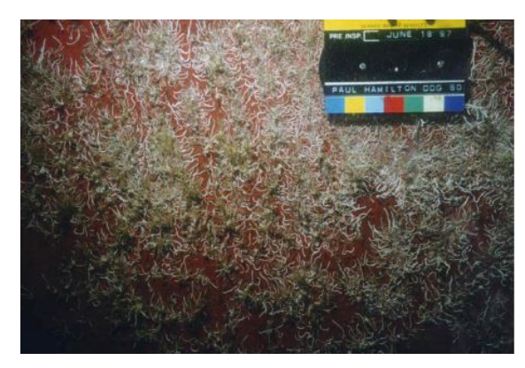
Figure 7: FR40, covering 90% of the surface area.