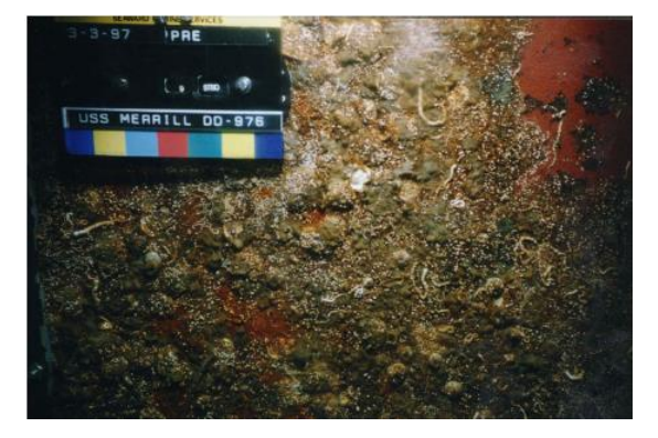
Figure 16: FR-80, covering 80% of the surface area.