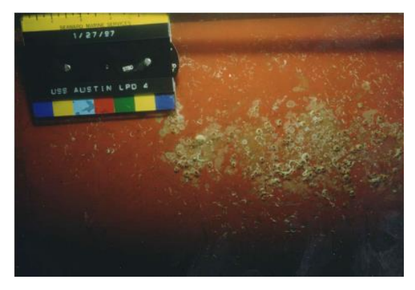
Figure 11: FR-60, covering 15% of the surface area.