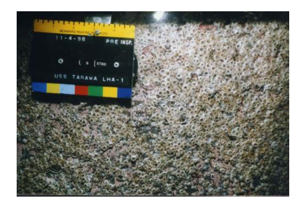
Figure 10: FR-50, covering 100% of the surface area.