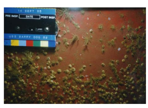
Figure 9: FR50, covering 40% of the surface area.