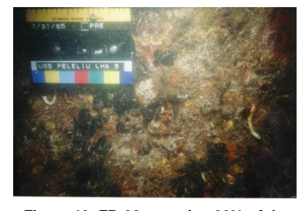
Figure 19: FR-90, covering 90% of the surface area.