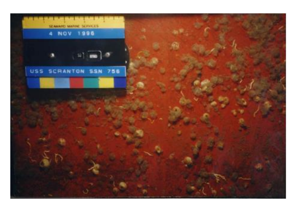
Figure 12: FR-60, covering 20% of the surface area.