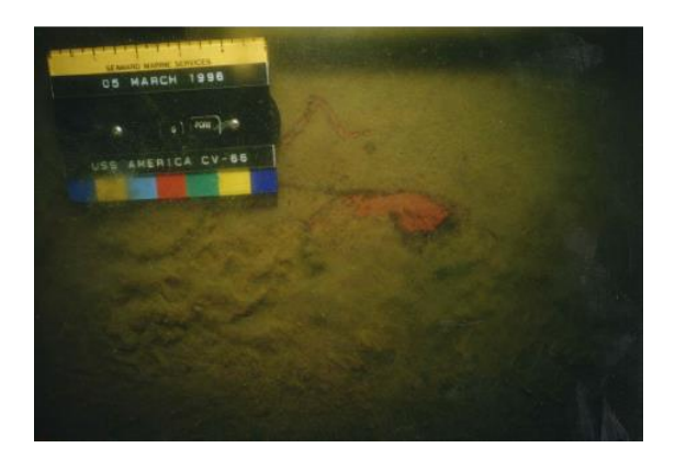
Figure 2: FR10, covering 100% of the surface area.