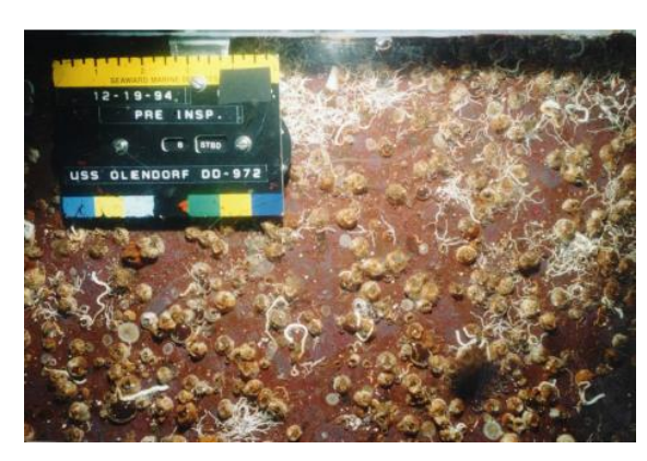
Figure 15: FR-70, covering 80% of the surface area.