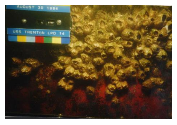
Figure 20: FR-90, covering 90% of the surface area.