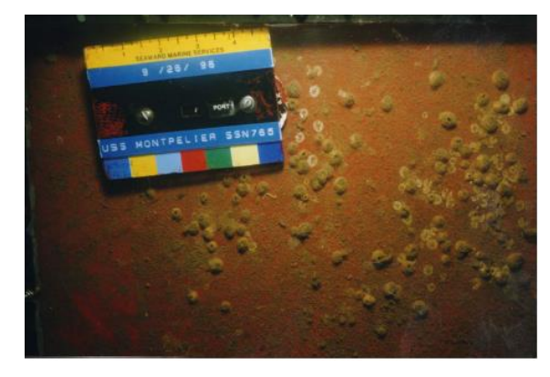
Figure 8: FR50, covering 20% of the surface area.