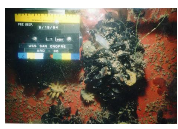
Figure 21: FR-100, covering 50% of the surface area.