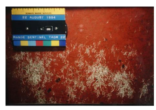
Figure 6: FR40, covering 30% of the surface area.