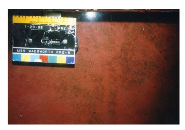
Figure 1: FR10, covering 30% of the surface area.

Biofouling Scale (Informative)<sup>1</sup>