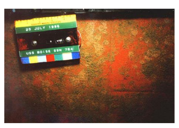
Figure 3: FR20, covering 80% of the surface area.