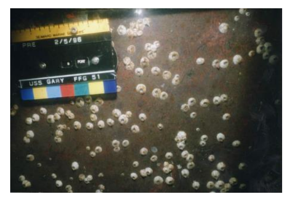
Figure 14: FR-70, covering 20% of the surface area.