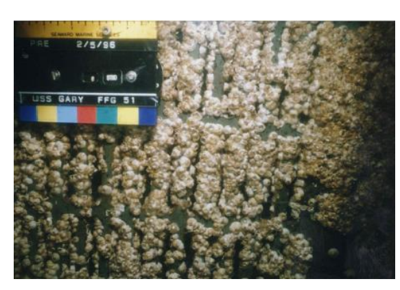
Figure 18: FR-80, covering 90% of the surface area.