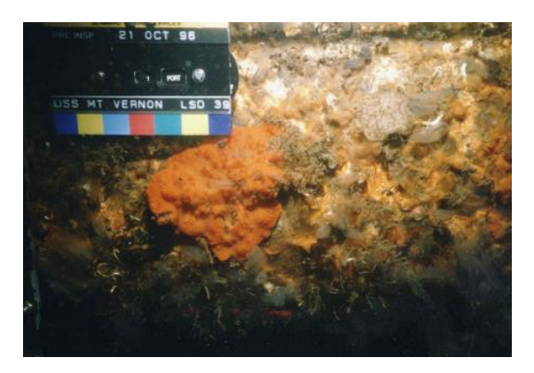
Figure 22: FR-100, covering 50% of the surface area.