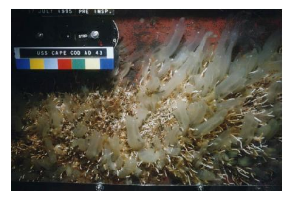
Figure 17: FR-80, covering 60% of the surface area.