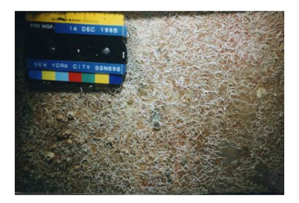
Figure 13: FR-60, covering 90% of the surface area.