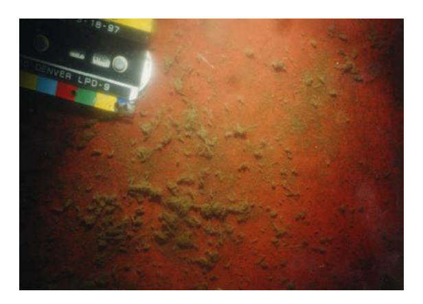
Figure 4: FR30, covering 40% of the surface area.