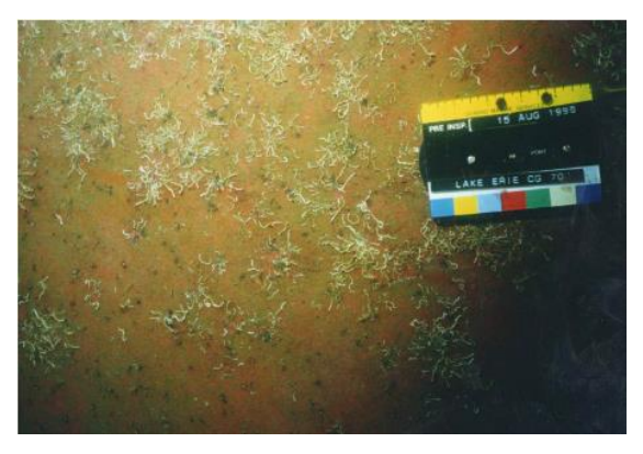
Figure 5: FR40, covering 20% of the surface area.